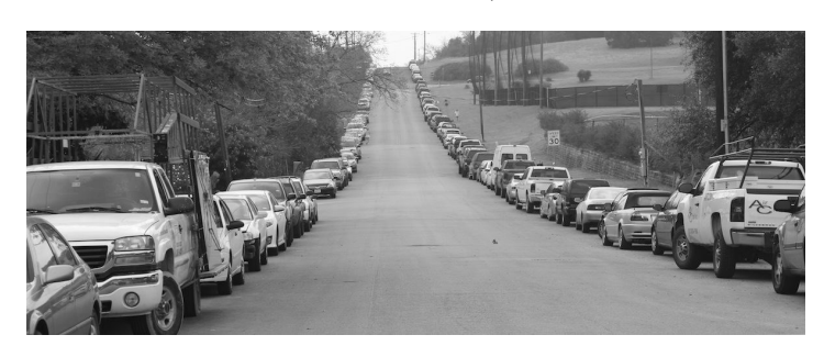
No sidewalks on St. Edwards Dr. looking east from the Operations Building. Now, add 18 wheeler trucks, kids on bikes, and intoxicated students....